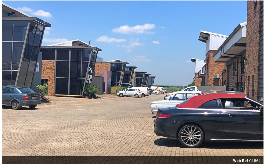
Web Ref CL564

1st Floor, Midcity Building, 37 Brown Street, Nelspruit, 1201