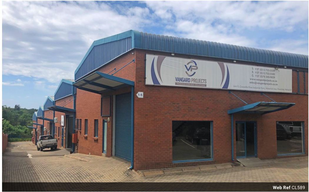
Web Ref CL589

1st Floor, Midcity Building, 37 Brown Street, Nelspruit, 1201